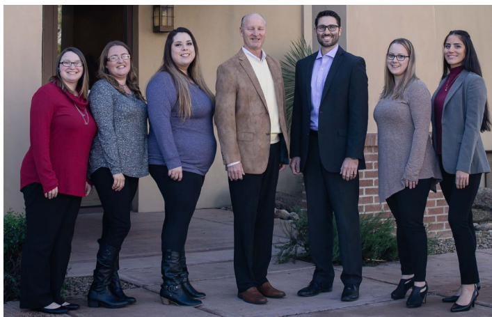
The Underhill Team

Coordinating clients' personal financial plans with legal and tax professionals