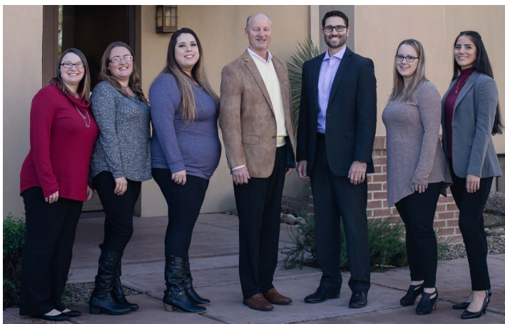
The Underhill Team

Coordinating clients' personal financial plans with legal and tax professionals