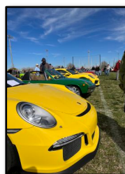
ON THE COVER: Sahuarita Car Show