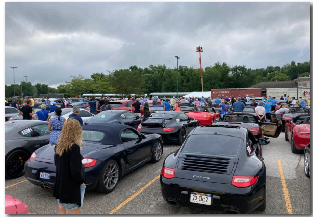
2021 Parade of Porsches staging area

FYI – Sign up for Phase 1 (your car number and lodging) opened February 1 st and sign up for Phase 2 (events, banquets, etc.) opens at noon ET on Wednesday, April 5 th . Have your car number handy (you get this from Phase 1 registration) as well as your credit card for this phase. In case you’re wondering, your car number is how you’re identified by the National staff at this event, yes, you are “just a number.” Lol. Registration closes on Saturday, May 13 th at 11:59 pm ET. Happy registering. If you have any questions before hand, feel free to contact a former Parade attendee, which SAR has many.