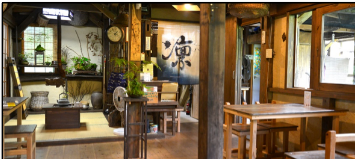
The delightful, relaxing interior

There were two older ladies and a man at a nearby table who were watching with interest. Naomi introduced us,