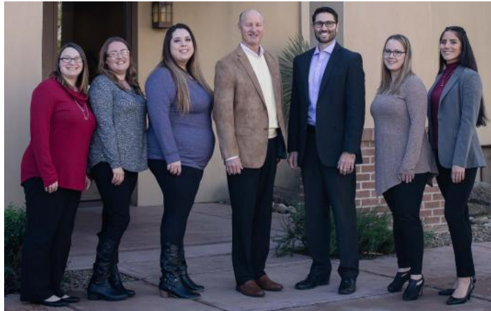
The Underhill Team

Coordinating clients' personal financial plans with legal and tax professionals