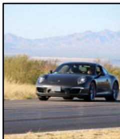
ON THE COVER: December DE Event