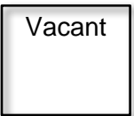
Cinco Chair Vacant