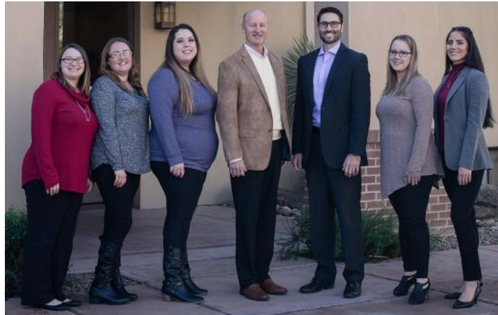
The Underhill Team

Coordinating clients' personal financial plans with legal and tax professionals